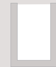
STORAGE LOCKER 3' X 5'